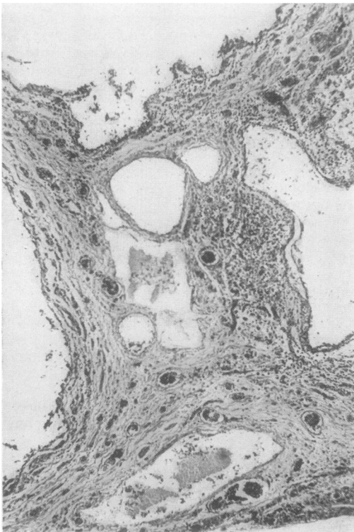
FIG. 2. Case 2. Low-power view of a section of the lung ( \times 180 ).

Oswald and Parkinson (1949) were the first authors to emphasize that honeycomb lungs occur in various diseases in which there is diffuse interstitial pulmonary infiltration. In six of their patients there was an associated disorder such as tubercular sclerosis, xanthomatosis, biliary cirrhosis or pituitary disease. In the other 10 cases no such recognizable disease was noted and, where histological examination was carried out, extensive interstitial pulmonary fibrosis was found. Heppleston (1956), in an extensive study of the pathology of honeycomb lung, considered that the essential abnormality was an obliteration of the respiratory or non-respiratory bronchioles. He suggested that neighbouring unaffected bronchioles then underwent compensatory enlargement to form the cystic spaces. In the majority of his cases the obliterative process was a non-specific, interstitial fibrosis though in some a recognizable granulomatosis was seen. Heppleston concluded that honeycomb lung was, in most instances, the result of patchy, interstitial fibrosis. The distinction between the two conditions is probably, therefore, somewhat artificial and, as shown by our case 2, radiological differentiation may be quite impossible.