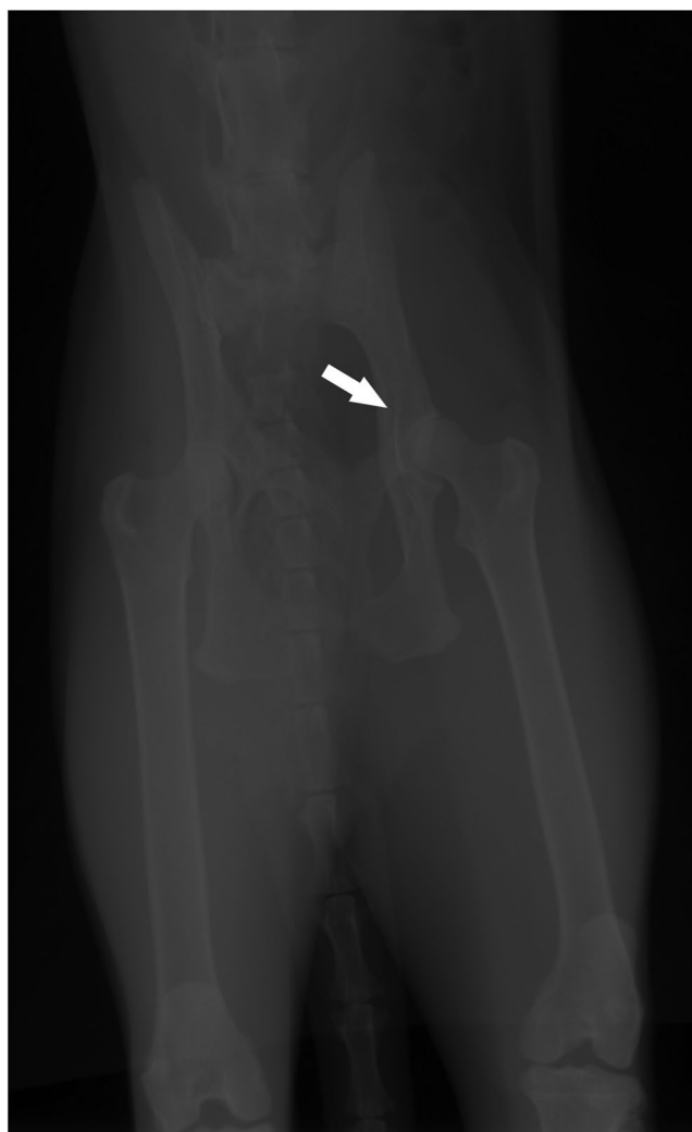
FIGURE 2 Left hip joint. Acetabular sclerosis and mild periosteal reaction on the cranial edge of the acetabulum, which could suggest incipient degenerative (white arrow).

Following radiographic examination, blood samples were obtained and submitted for CBC and biochemical analysis. The results showed an elevated alkaline phosphatase (ALP) of 107 IU/L. The remaining values were within normal limits for the species (Table 1). Due to haemolysis in the EDTA tube, it was not possible to perform a CBC