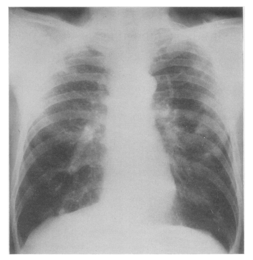
FIG. 1. Chest radiograph showing reticulation and also the presence of larger nodules.

to be positive to a dilution of 1:1,250. The pulmonary function studies obtained at this time are shown in Tables I and II. They demonstrate an increased residual volume, functional residual capacity, and total lung capacity with no significant airway obstruction. The arterial blood studies show a normal saturation with a marked reduction of the PCo<sub>2</sub> level. This indicates marked