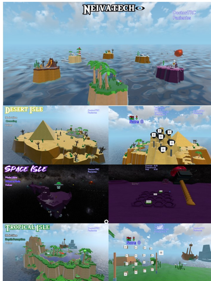
Figure 1. Main scene and mini-games of the prototype of software used for training purposes.

All VR devices are dichoptic, and any software used for VR-based training displays scenes dichoptically treat the subject. The difference between the present software and those previously used and validated for vision training is that the stimuli used have been specifically designed to benefit the amblyopic eye, being based on a Gabor sinusoidal grating. Specifically, these patches are only shown in the amblyopic eye, whereas the other eye receives the scene without the Gabor stimuli. The scene objects, where the patches were positioned, were specifically designed to favor the integration of the monocular stimulus in a binocular environment. The scene was a totally immersive scene over 360°.