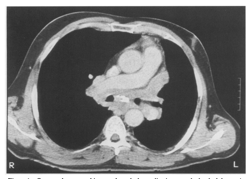
Figure 1 Computed tomographic scan through the mediastinum at the level of the aortic arch. A confluent abnormal soft tissue mass can be seen surrounding and deforming the main bronchi. A focus of calcification is seen in the subcarinal region, presumably within a lymph node mass. Previous history of tuberculosis.

Bronchoscopy was performed in all patients and in two cases there was evidence of external compression because the wall of the bronchus appeared to be distorted and narrowed but no endobronchial lesions were seen. Both provided sufficient biopsy material to make a diagnosis in keeping with sclerosing mediastinitis. Four patients proceeded to mediastinoscopy because of a mass at the hilum with probable paratracheal and subcarinal lymph node involvement. Eight patients had a median sternotomy, six for superior caval bypass grafting, one for routine coronary artery bypass grafting,