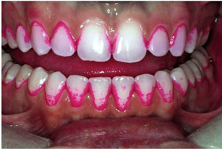
FIGURE 2: Plaque index scoring in patients

In this research, a total of 222 individuals who met the eligibility and exclusion requirements at Dr. B.R. Ambedkar Institute of Dental Sciences and Hospital were randomly selected and offered their written consent. The ethical clearance number is IEC/2022/11. A one-month flushing timespan was required after oral prophylaxis and the start of orthodontic therapy with fixed orthodontic appliances in order to cancel the effects of the ultrasonic scaler. All study participants were then called back one month later to document preliminary information, including that of the modified papillary bleeding index (MPBI), plaque index (PI) introduced by Silness and Loe, and gingival index (GI) introduced by Loe and Silness. When the investigator was calibrated, the average value of the kappa coefficient was determined to be 0.8, indicating a strong consensus. The intra-examiner heterogeneity was evaluated using the kappa variability analysis (Figure 2).