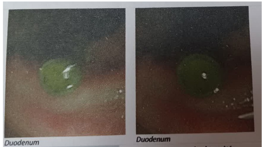
FIGURE 2 ERCP results after sphincterotomy and balloon dilation. Endoscopic retrograde cholangiopancreatography (ERCP) results after the insertion of a common bile duct (CBD) stent.

responsible for bile duct involvement in critical illness patients. 7 After the virus spreads from the gastrointestinal tract to the blood through the portal tract system, it passes to the bile duct system. ACE2's presence is moderately low in hepatocytes that are primarily located in upper levels of cholangiocytes. There are limited histological data about the mentioned patients but the examination of liver biopsies shows varying degrees of portal fibrosis and large duct obstruction. 8 Evidence shows that the stimulation of a prothrombotic state by SARS-CoV-2 subsequently causes endothelial damage. These changes expose the tissue factor and collagen in the subendothelial matrix that triggers the coagulation cascade and subsequently results in the generation of thrombin. When these events are accompanied by platelet aggregation, it results in blood clots in hepatic arterial branches that supply the epithelium of the bile duct. On the other hand, there is a higher susceptibility of the intrahepatic biliary epithelium to ischemia since there is a single blood source through the hepatic arteries. 9 In one case study, secondary sclerosing cholangitis (SSC) was diagnosed in a severely ill patient induced by COVID-19 that demonstrates a rare ailment specifically developed in the setting of SARS-CoV-2 infection. 7