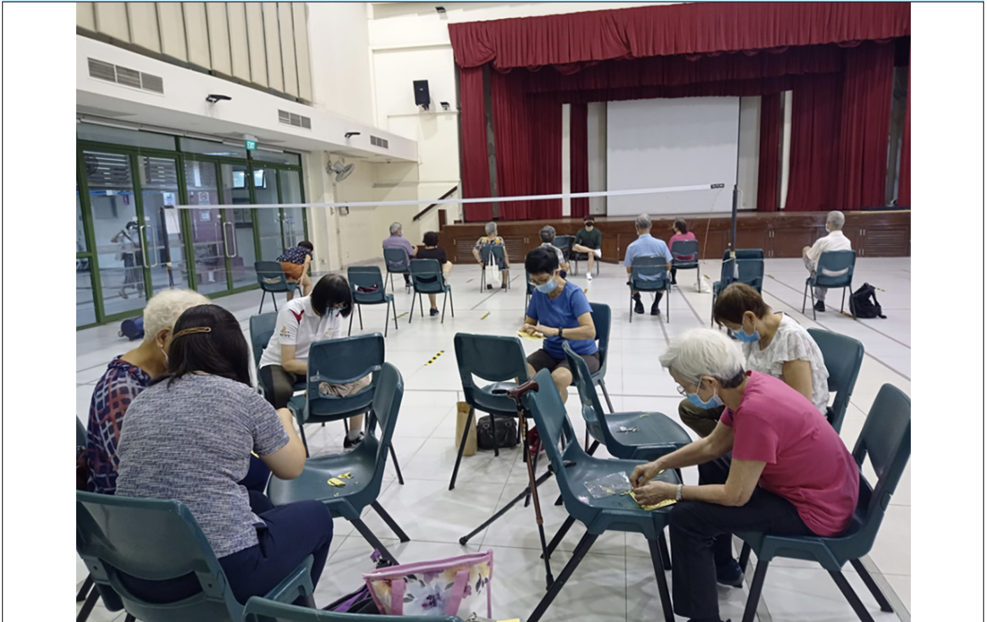
Figure 2. Group Based Cognitive Stimulation Therapy

a detection range of 2.0 - 400.0 pg./mL and GDF-15 with a detection range of 2.0 -2400 pg./mL.