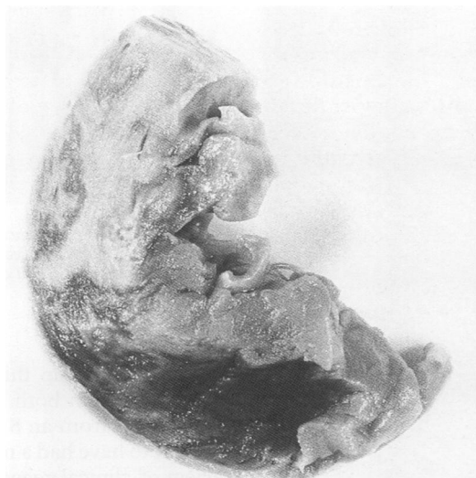
Figure 1 Slice of left ventricle from a 62 year old man stained by the nitroblue tetrazolium/phenazine methosulphate method seven days after a myocardial infarct. Non-infarcted myocardium appears dark and infarcted myocardium appears white. The junction between the dark and white areas is irregular, producing a mottled pattern at the edges of the main white area.

and applied to sections for 60 minutes at room temperature on a Shandon Sequenza immunostaining centre. After washing, peroxidase conjugated donkey antiserum to sheep IgG at a dilution of 1 in 100 was applied for 45 minutes. After another wash, peroxidase was detected with hydrogen peroxide and tetra-amino-biphenyl hydrochloride (diaminobenzidine), and sections were counterstained with haemalum, dehydrated and mounted.