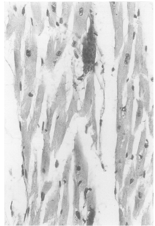
Figure 4 Immunohistological staining for C9 on a section of myocardium from a 57 year old man who died of peritonitis. Two myocardial cells contain C9 and appear dark.

Comparison of conventional staining with immunohistology for C9 is presented in table 2. The eight hearts in the group of suspected or confirmed myocardial infarction stained by C9 but with no conventional evidence of infarction were all from patients with clinical evidence of infarction less than 24 hours old, whereas the 16 identified by staining with haematoxylin and eosin and also stained with C9 had infarcts from 24 hours to 20 days old (fig 3). The single