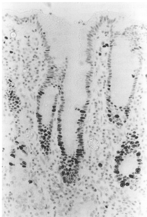
Figure 2 Photomicrograph of gastric mucosa stained with MIB-1.

The development of the monoclonal antibody MIB-1, together with microwave pro-