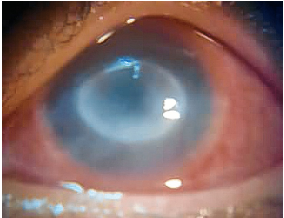
FIGURE 1: Initial presentation of a ring-like stromal infiltrate and a lack of bulbous dendrites

border. It was associated with an edematous cornea (Figure 1). The conjunctiva was moderately injected. There was no hypopyon, but a minimal anterior chamber reaction was found. The intraocular pressure in both eyes was measured to be 14 mm Hg using a non-contact tonometer. A fundusoscopic examination did not result in anything remarkable.