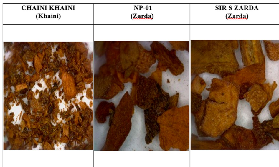
Figure 1. 3-D Images of smokeless tobacco products (SLT).