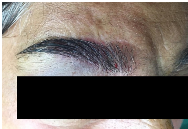
FIGURE 3 The lesion after 6 month of hair transplantation with follicular unit transplantation technique.

exposure, and immunocompromised status as predisposing factors for MAC. 2,3,8,16