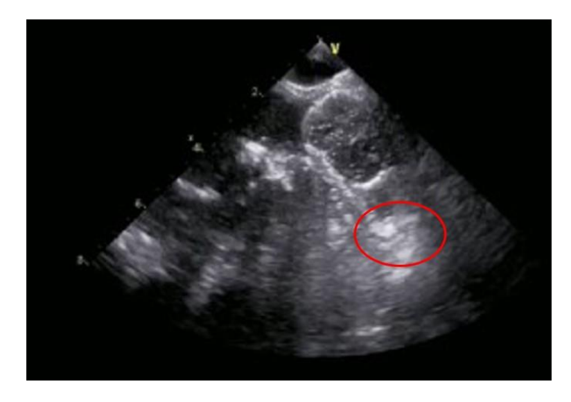
Figure 1. Transesophageal echocardiography image of LAAO with Watchman FLX in the presence of LAA thrombosis.

The feasibility and the safety of LAAO in the presence of thrombus was assessed in the multicenter retrospective registry TRAPEUR, where 53 patients (3%) underwent LAAO with Amplatzer Amulet (86%) and Watchman FLX (14%) in the presence of LAA thrombosis [16]. Only one patient met the primary endpoint of 30-day occurrence of stroke, CE, or cardiovascular death. A transesophageal echocardiography image of LAAO with Watchman FLX in the presence of LAA thrombosis is represented in Figure 1.