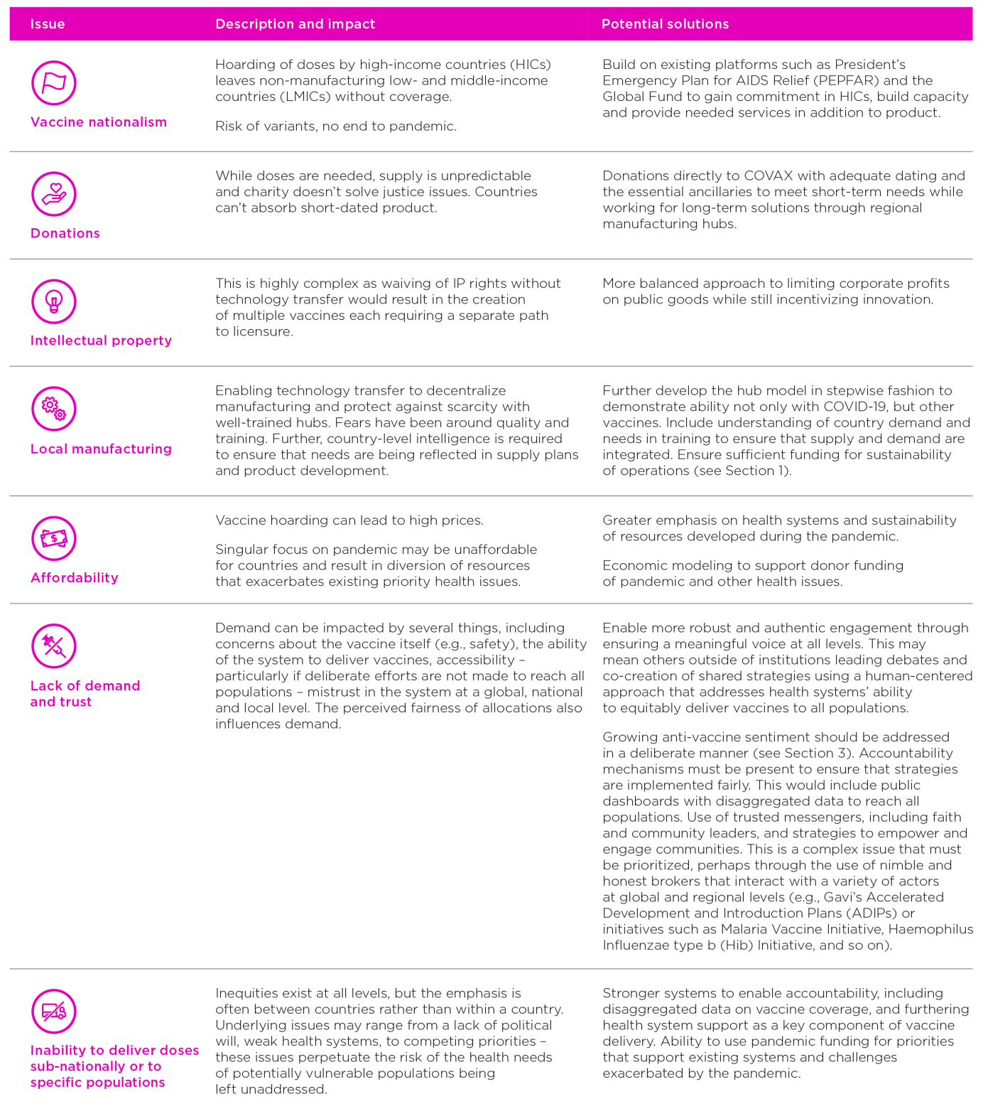
Figure 3 Potential solutions for improving COVID-19 vaccine and vaccination equity and justice. Excler et al. 46

the pandemic to an end. 40 But as supply issues ease, the progress in equity both among and within countries is revealed. In order to see equitable allocations, there must be three things that happen: the product that fits the needs of the countries, financing to ensure they can