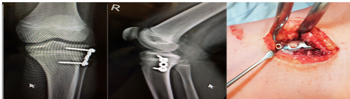
FIGURE 1 Hemiepiphyodesis using a 3-hole tension band plate and two cortical screws.

In the study, a total of 20 cases were examined, which included 37 limbs. Of the 20 cases, 12 were male and 8 were female. The patients' mean age during implantation was 12 years and 4 months. On a gender basis, the females had an average age of 11 years and 10