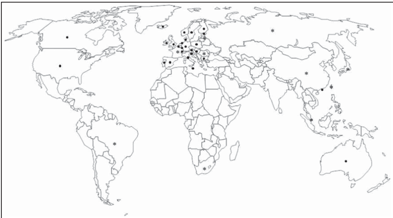
Fig. 1 World map showing the thirty-six countries in which recommendations for folate and folic acid intake in the periconceptional period were analysed (●, country with official validation; *, country without official validation)

From the forty-six countries initially considered, ten (21.7%) were excluded – six in the EU (Croatia, Cyprus, Czech Republic, Greek, Lithuania and Slovakia), two European countries not belonging to the EU (Liechtenstein and Turkey), one BRICS country (India) and one Asian Tiger/Asian Dragon country (South Korea) – on the basis of data being unavailable or not found. Thus a final sample of thirty-six countries was obtained: twenty-two in the EU (Austria, Belgium, Bulgaria, Denmark, Estonia, Finland, France, Germany, Hungary, Ireland, Italy, Latvia, Luxembourg, Malta, Netherlands, Poland, Portugal, Romania, Slovenia, Spain, Sweden and UK), three European countries not belonging to the EU (Iceland, Norway and Switzerland), four BRICS countries (Brazil, Russia, China and South Africa), three more G8 countries (the other five were already stated in EU and BRICS; Canada, Japan and USA), three Asian Tiger/Asian Dragon countries (Hong Kong, Singapore and Taiwan) and Australia; see Fig. 1.