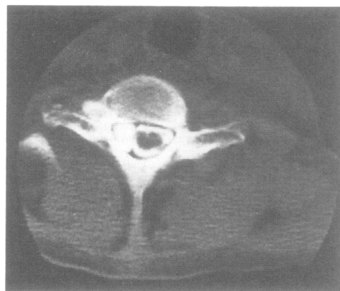
Fig 2 Metrizamide CT scan demonstrating pseudo-meningocele within the canal extending into the intervertebral foramen associated with hemi-atrophy of the cord and displacement of the spinal cord towards the opposite side.