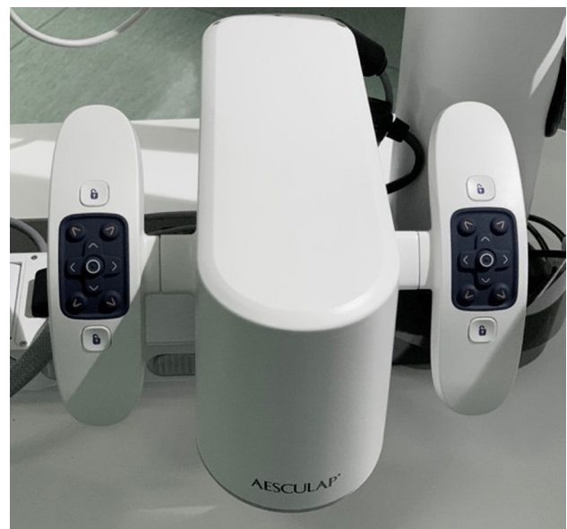
Fig. 2 Two different control areas are located on the right and the left side. The surgeon can choose the position of the commands in the 2 areas in order to move the robotic arm, to select the light intensity and to check the focus. Moreover, it is possible to take pictures and videos and save the position of the arm in the space

and save the arm position in the space (Fig. 2). The surgical field is displayed on two movable 3D monitors (32'' and 55'') positioned on the opposite side of the surgical table in front of surgeon and the assistant. In order to obtain a