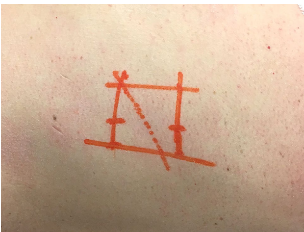
Fig. 3 The skin incision (dashed line) is an oblique 6 cm incision on the left side of the thoracolumbar spine. The skin landmarks are the two endplates, the anterior and posterior wall of the vertebra (continuous lines)

Sequential tubular dilators were then inserted at the correct level, under fluoroscopic guidance. After the complete exposure of our target (the vertebral body and the two adjacent discs), a deep three-blade retractor was inserted and fixed to the operating table (Fig. 4). The exoscope was then introduced in the operating setting and maintained over the surgical field for the rest of the procedure. The adjacent disks were removed and the corpectomy was performed with diamond cutter in order to minimize bleeding and to avoid the traumatic effect of osteotomes on the endocanal structures.