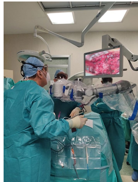
Fig. 1 Operating setting with the robotic arm positioned on the surgical field and the surgeon performs the spinal cord decompression looking at the 32'' 3D monitor

Exoscopy developed and refined over the past decades, evolving from former standard definition cameras and 2D visualization systems toward HD cameras and 3D instrumentations, allowing a wide and effective application of a new technology called exoscope. It is a particular type of telescope with zoom (10x), automatic focus functions, integrated illumination, and robotic arm (Fig. 1). Every type of spinal surgery has a standardized operating setting. Through a control unit, the surgeon is able to focus, modify the magnification, shift the orientation of the small camera,