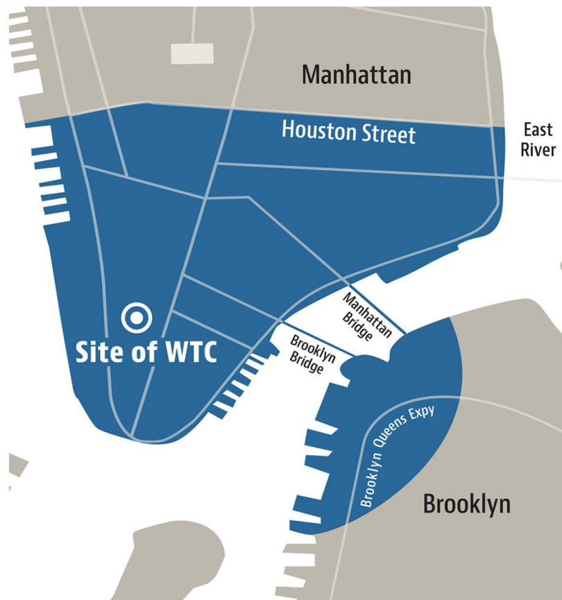
Figure 2. New York City (NYC) disaster area used to determine enrollment eligibility for survivors of the 9/11 attacks — World Trade Center (WTC) Health Program. The NYC disaster area for the WTC Health Program is defined as the area in Manhattan south of Houston Street and any block in Brooklyn wholly or partially contained within a 1.5-mile radius of the former WTC complex. Survivors are defined as persons who were present in the dust or dust cloud on 9/11 or who worked, lived, or attended school, child care centers, or adult day care centers in the NYC disaster area.