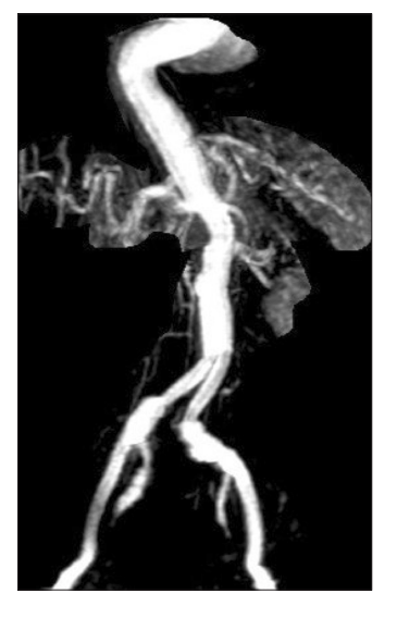
Fig. 2. Postoperative magnetic resonance tomography angiography showed the exclusion of the aneurysm and stenosis-free flow to the groins.