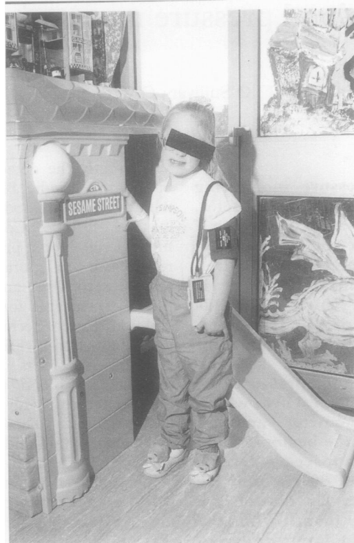
Figure 1 A 5 year old girl wearing the recorder. This is a lightweight device and can easily be concealed under clothing if desired.

graphs of systolic blood pressure, diastolic blood pressure, and heart rate are printed out by means of a miniature analyser measuring 5 \times 7.5 \times 15 cm. Error readings are indicated by one of 12 codes. The machines measure in a range for systolic pressure of 60 to 280 mm Hg with a diastolic pressure of 40 to 160 mm Hg. Readings are edited if they fall outside this range or if the pulse pressure is less than 10 or greater than 150 mm Hg. This is the quietest (noise 40 dB) and the lightest product of its kind on the market currently. Figure 1 illustrates a 5 year old girl wearing the recorder and the analyser coupled to the recorder reading to program or retrieve data.