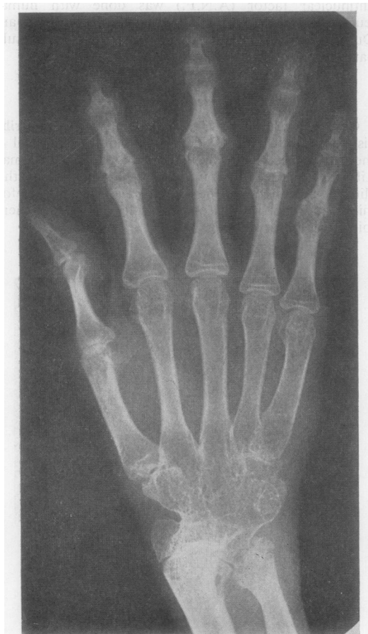
Fig. 2.—Case 1, x-ray of right hand, showing advanced erosive arthritis with osteoporosis and ankylosis.

An x-ray photograph of the hands showed advanced erosive polyarthritis with ankylosis (Fig. 2).