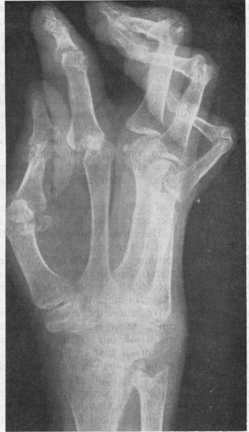
Fig. 5.—Case 2, x-ray of right hand, showing osteoporosis, narrowing of joint spaces with erosions, and subluxation.

The final classification of a disease is only possible if its cause and pathogenesis are known. In the absence of this knowledge a diagnosis had to be founded on a combination of data obtained by clinical observation and/or laboratory analysis. The number of positive criteria is a measure of the degree of certainty of the diagnosis, whereby the contribution of each criterion depends on its sensitivity and its specificity. Rheumatoid arthritis is a good example of this situation. On the initiative of the American Rheumatism Association, diagnostic criteria have been prepared, and these are being revised and modified periodically (Kellgren, 1963). In addition to several categories, which together present the full evolution of this disease, there is a list of exclusions which comprises a number of known diseases, each of which has one or more characteristics, which may also be associated with rheumatoid arthritis. One has to remember, however, that there may be other syndromes mimicking rheumatoid arthritis which have not yet been studied from this point of view. This may occur particularly in regions where rheumatoid