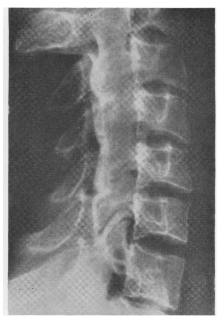
Fig. 5.—Bony fusion of apophyseal joints with early changes along the anterior vertebral bodies (Case 4).