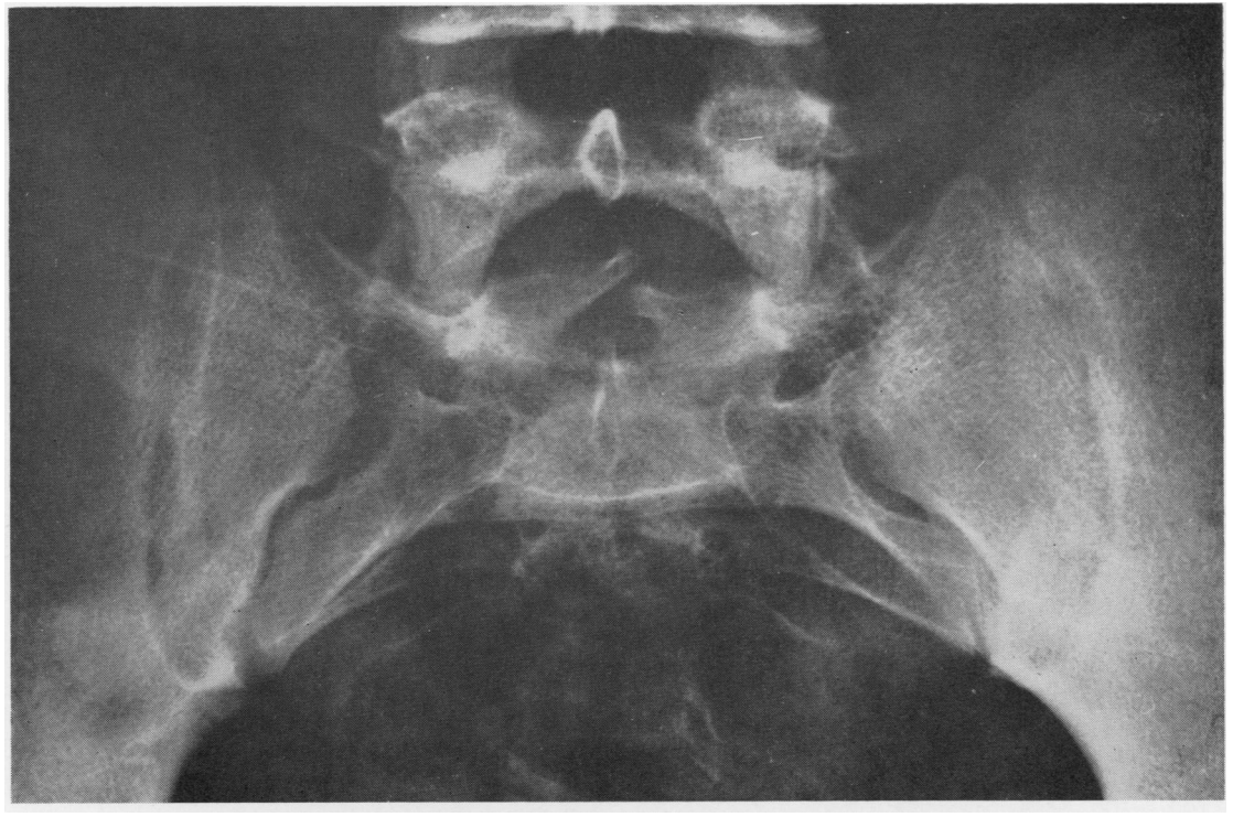
Fig. 1.—Sacro-iliitis in a patient with a past history of two attacks of polyarthritis.