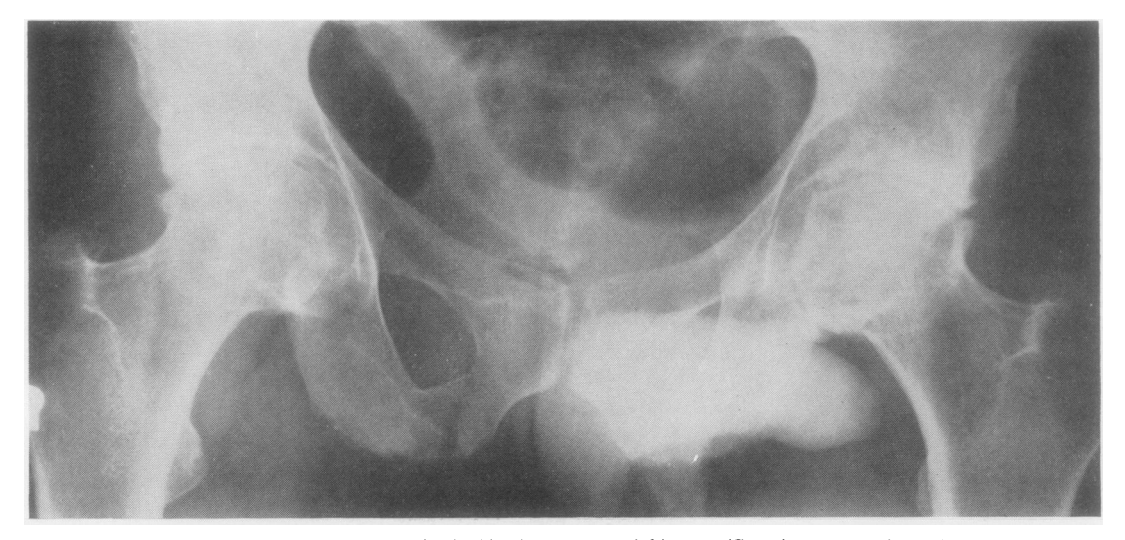
Fig. 2.—Narrowing, sclerosis, and erosive changes in the hips in a man aged 34 years (Case 4, see appendix), with an 11-year history of ankylosing spondylitis and regional enteritis.