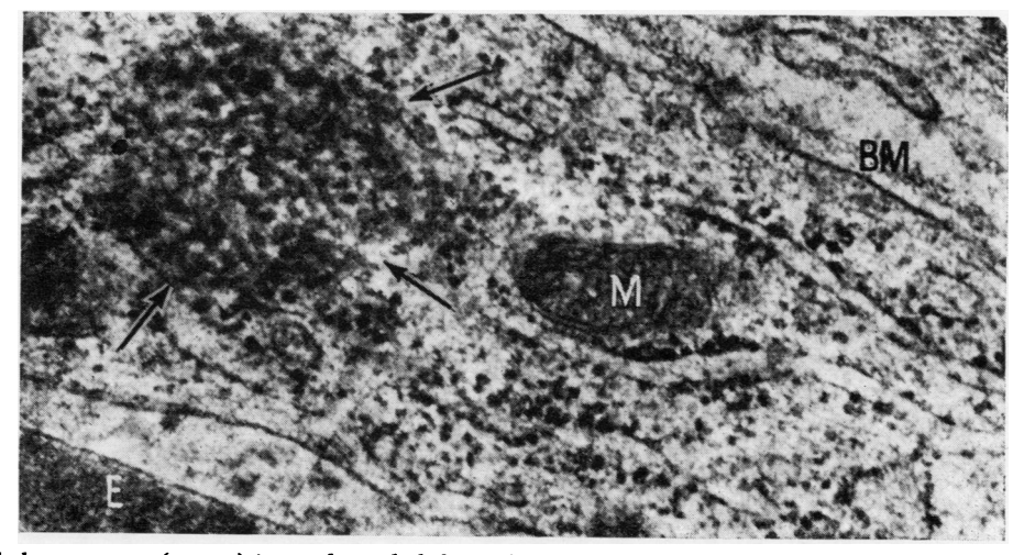
FIG. 1 Tubular aggregate (arrows) in venular endothelium of a 16-year-old girl with systemic lupus erythematosus.

(1) A 16-year-old girl had systemic lupus erythematosus. She had arthralgias without objective joint changes and no effusions. Synovial biopsy of the knee, however, showed focal synovial cell lining proliferation, vascular congestion with large endothelial cells and multilamination of some basement membranes, perivascular mononuclear cell infiltration, and perivascular and superficial fibrinlike material. The tubular aggregate seen by electron microscopy (Fig. 1) was in a venule that appeared otherwise normal. Diameter of the paramyxovirus-like tubules was approximately 220 Å.