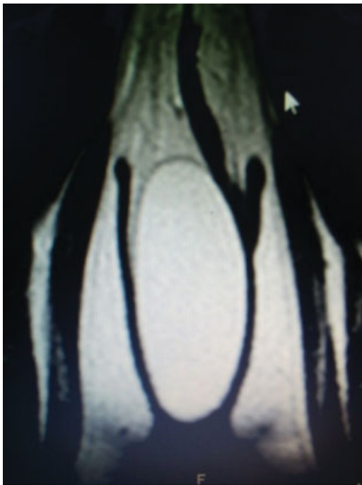
Fig. 2 Magnetic resonance imaging scan showing oval soft tissue mass with well-defined capsule.

which is typically observed in subcutaneous fat, but may develop in almost all body organs, including the vulva, which is a rare site for lipoma development.