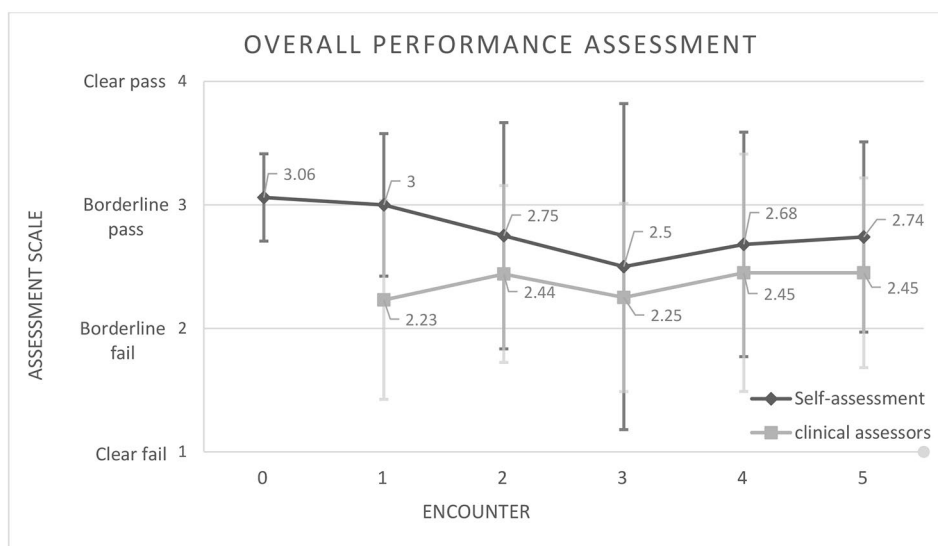
Fig. 2 Mean of participants' self-assigned scores and that of clinical assessors in the overall performance assessment item (n.22) in the screening survey (encounter 0) and the in the 5 DOPS encounters

The gap between SA and TA differed from one skill to another. SA and TA both fluctuated between encounters, but in general, SA decreased and TA increased. Participants' ability to identify areas of improvement and areas of excellence consistently improved over the five encounters. Similarly, participants' clinical performance as assessed by supervisors improved steadily in the first four encounters yet dipped in the last encounter. Positive attitudes towards the assessment method utility were expressed by participants.