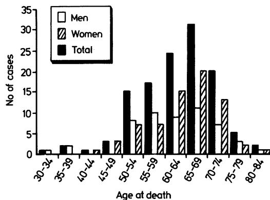
Fig 1 Age at death for 121 definite and probable cases of Creutzfeldt-Jakob disease (includes three cases dying after 1984).

Age at death for the 121 patients who had died by the time of reporting is shown in fig 1. The mean age was 63.2 years (range 33-82). The mean in men was 62.3 years and in women 63.8 years. Age and sex-specific average annual mortality rates are shown in fig 2. Mortality rates rose rapidly with age up to about 70 years and then fell markedly. The excess rates in