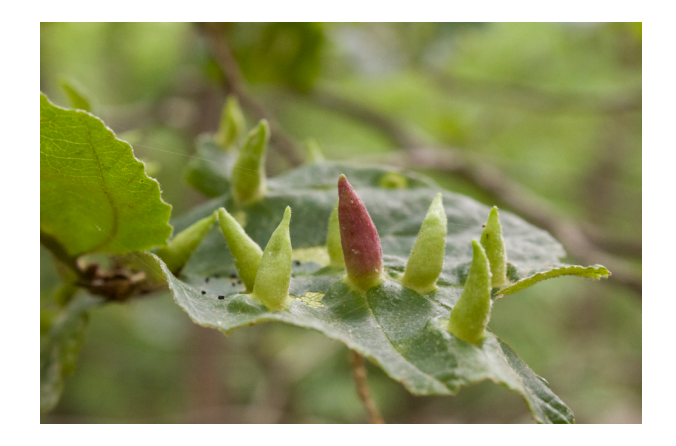
Figure 1. Red and green galls induced by Hormaphis cornus aphids on leaves of witch hazel Hamamelis virginiana at Janelia Research Campus, Ashburn, Virginia