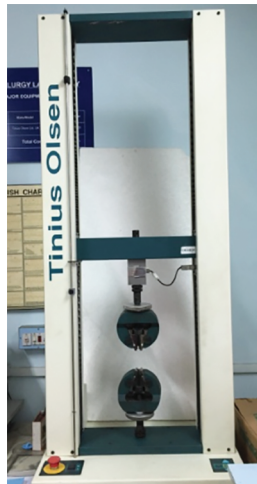
Fig. 3: Instron universal testing machine