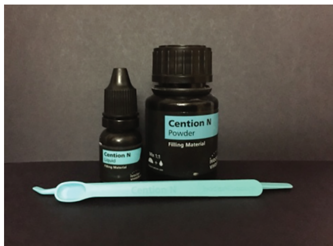
Fig. 1: Cention N alkasite resin-based material

Manipulation of materials was done according to the manufacturer's instructions. Cention N (Ivoclar Vivadent, LOT X 54164) is marketed