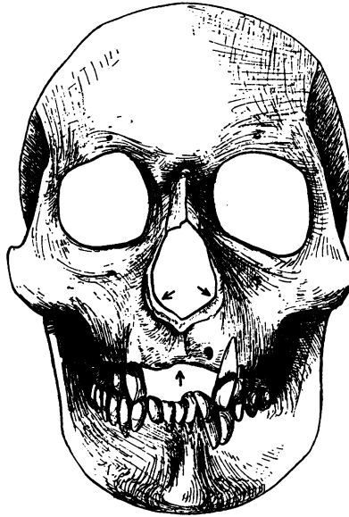
Skull of Robert the Bruce. Norma facialis (from a cast). Showing the upper facial anomalies.

is not typical of leprosy, yaws or syphilis, whereas the marginal resorption seems more typical of leprosy than the other two, although there is still much to be learnt about variation in nasal changes resulting from these diseases.