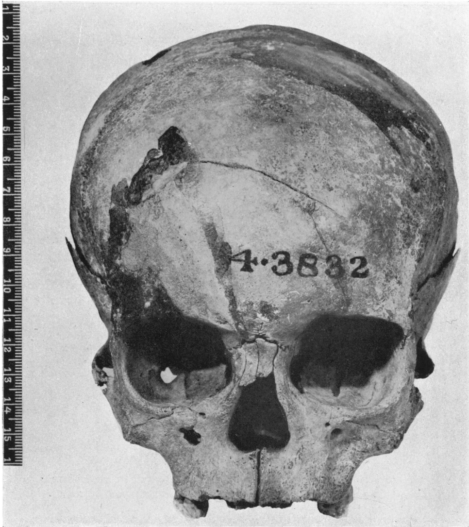
Scarborough Skull 4.3832. Norma facialis .

Exhibiting resorption of the pyriform aperture margins and minor osteoporosis of the frontal part of the maxillae.