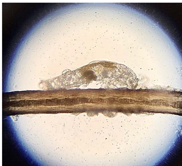
FIG. 1. Demodex folliculorum is found in human skin, especially the cheeks, nose, and eyelids.

As Demodex mites consume epithelial cells at the hair follicle, their sharp claws cause microabrasions, inducing epithelial hyperplasia. 4,16,21 The presence of D. folliculorum is strongly associated with hair follicle duct dilatation and hyperkeratinization and peri-