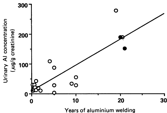
Figure 1 Aluminium concentration in urine obtained from 23 welders after a period (16–37 days) without exposure. Filled dots represent the two men who provided bone biopsies.

and urine samples obtained from aluminium welders and workers engaged in the production of aluminium powder when compared with non-exposed persons. 15,16 It is not known to what extent aluminium may cause systemic toxicity in exposed workers without renal failure, but one case report indicates that encephalopathy may indeed occur after heavy exposure to stamped aluminium powder. 17