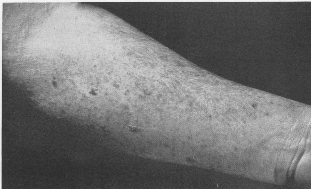
PLATE II.—Hyperkeratotic lesions on arms of machine operator. This patient eventually died as the result of scrotal cancer.