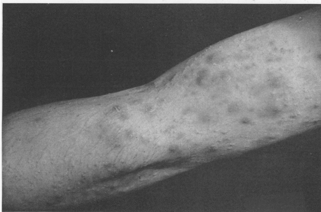
PLATE I.—Severe Oil Folliculitis—showing comedones, folliculitis and granulomatous lesions.