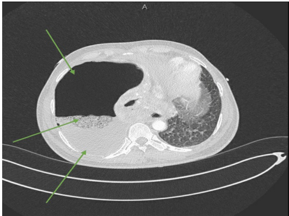
FIGURE 2: A substantial air-fluid cavity is evident in the right hemithorax, strongly suggestive of an empyema (bottom arrow) causing the collapse of the right lung (middle arrow).

The lower lobe shows breakdown, raising the possibility of communication with the empyema and suggesting the potential presence of a bronchopleural fistula. However, definitive confirmation cannot be ruled out at this stage. These findings suggest the likelihood of chronic infection.