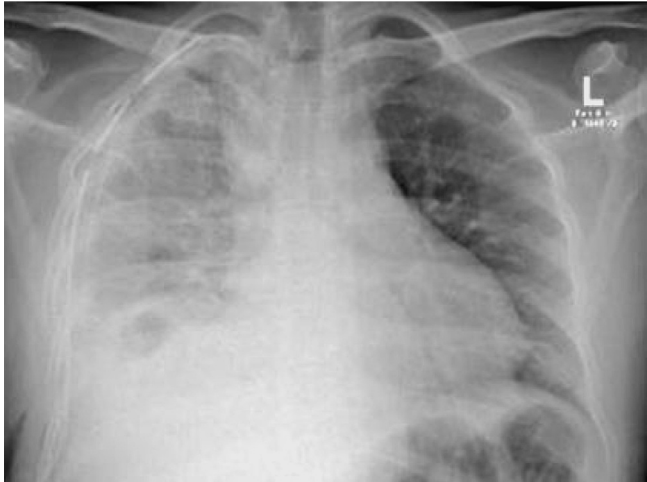
FIGURE 4: Right-sided chest drain with the tip projected at the right apex.

There is almost complete resolution of right-sided pneumothorax with the reexpansion of the right lung. Ground-glass opacification was suggestive of right-sided pleural effusion with basal atelectasis.