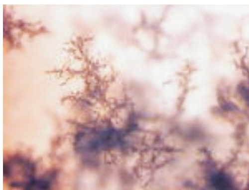
Figure 2 A pleomorphic microbe isolated from a rat tumour by Wainwright and Al Talhi 9 . Although the isolate looks like a fungus, under the electron microscope it is clearly seen to be a bacterium (identified as Bacillus licheniformis ) which was linked by the above authors to one of the historical “cancer germs”.

instructive to note that the incidence of stomach ulcers (and thereby stomach cancers) did not decrease with the introduction of antibiotics simply because a cocktail of antibiotics (plus bismuth) is generally needed to kill H. pylori . It will be intriguing to see if epidemiology shows that the cohort of patients who have received antibacterial treatment for ulcers show a reduction in the incidence of all types of cancer.