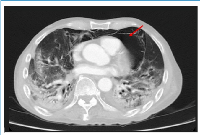
FIGURE 2: Computed tomography (CT) of the thorax with pneumomediastinum and pneumopericardium shown by the red arrow.