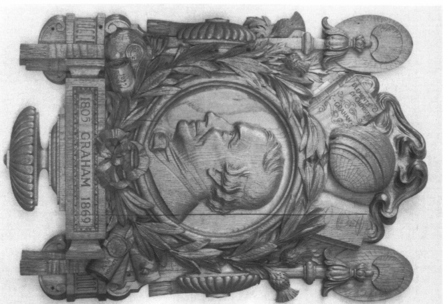
Plate 1: Wood carvings in the Colman Library, Dunn Institute of Biochemistry, University of Cambridge: (left) John Mayow; (right) Thomas Graham.