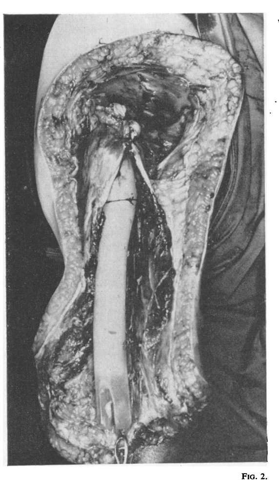
FIG. 1.—Acrylic prosthesis for the upper part of the femur. FIG. 2.—Acrylic prosthesis inserted in the thigh.