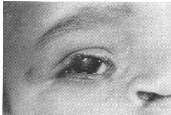
Fig. 5 Right eye of patient with amniogenic band syndrome showing upper and lower lid colobomas and corneal leucoma. Note traction groove from lower coloboma.

The incidence of amniotic bands is 1 in 5000 to 15 000 live births. 5 9 They are not necessarily more common in low socioeconomic groups. No hereditary factor is known, and the risk of recurrence is not increased for the patient's siblings or offspring. Some authors have postulated that trauma to the uterus during pregnancy causes amniotic rupture. 5