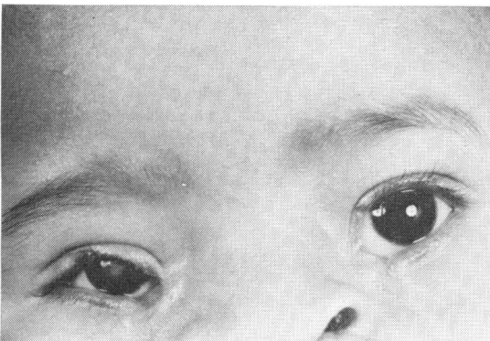
Fig. 4 Amniogenic band syndrome infant has upward slant of both palpebral fissures and bilateral colobomas of upper and lower lids. Small grooves that extend inferonasally from both lower lid colobomas probably represent sites of amniotic band attachment. Corneal leucoma is present in right eye; leucoma of left eye not seen under upper lid.

Proof of amniotic rupture without damage to the chorionic sac is no longer in question. 5 The strands of amnion may attach to the growing fetus and produce malformations as early as the first trimester. One-third of 327 fetuses in Torpin's series had attachments of the head and mouth at almost all stages of gestation.