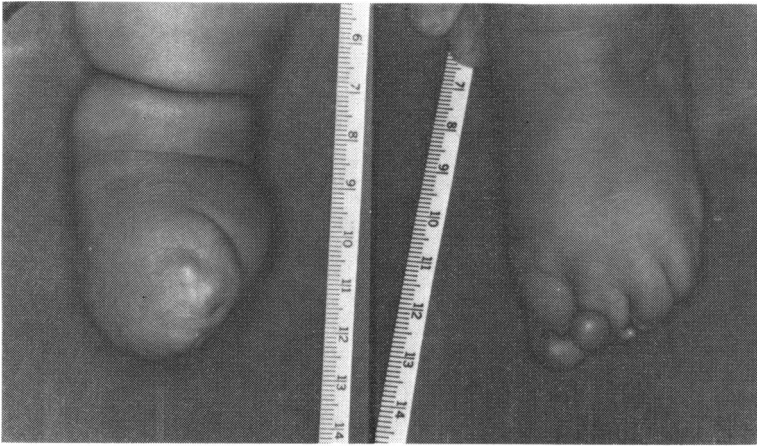
Fig. 3 Patient with amniogenic band syndrome showing absent right foot and ring constriction of lower leg (left) and ring constriction of left second toe (right).