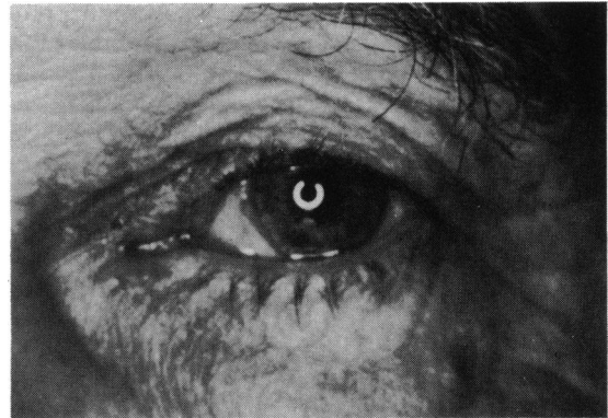
Fig. 3 Appearance of patient 2 months after starting therapy. Problem has been resolved.

Using the laboratory results of antibiotic sensitivities as a guide to therapy I began treatment with hot compresses, topical chloramphenicol ophthalmic drops 3 times daily to the left eye, and ampicillin 250 mg 4 times daily by mouth for 3 weeks. The swelling and tenderness improved after this therapy was begun. When the medication ran out, however, the swelling and tenderness of the upper left medial canthal region became acutely worse. After 2 days of extreme pain the area of tenderness 'broke loose' with the expulsion of a large glob of mucoïd material followed within several hours by the further expulsion of 2 small lumps of similar material. This resulted in decreased swelling and greater comfort. Treatment with topical chloramphenicol and oral ampicillin was resumed as before and continued for 4 weeks.