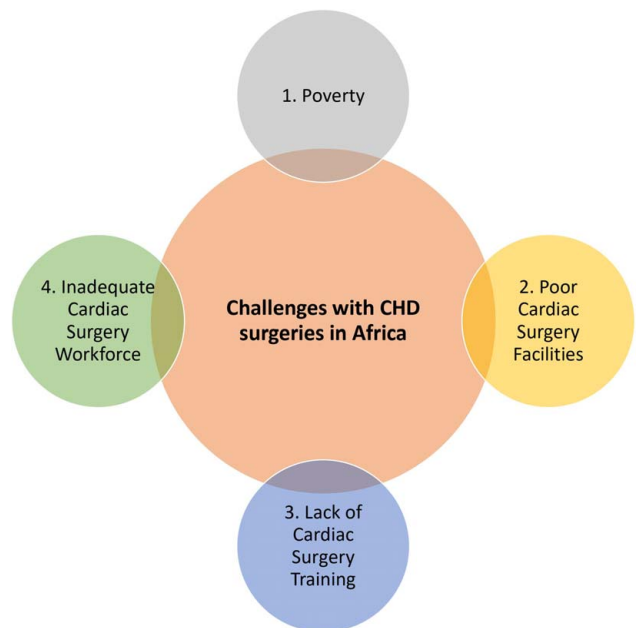
Figure 2. The major obstacles to congenital heart defects surgical delivery in African countries.

warranted. The National Surgical, Obstetric, and Anesthesia Plans (NSOAP) structure has been introduced to healthcare systems globally, but particularly in LMICs, in order to guide and enhance strategy plans [9-11] . Up until 2021, only six African nations; Zambia, Tanzania, Senegal, Ethiopia, Nigeria, and Rwanda, had developed and hoped to adopt NSOAPs, with