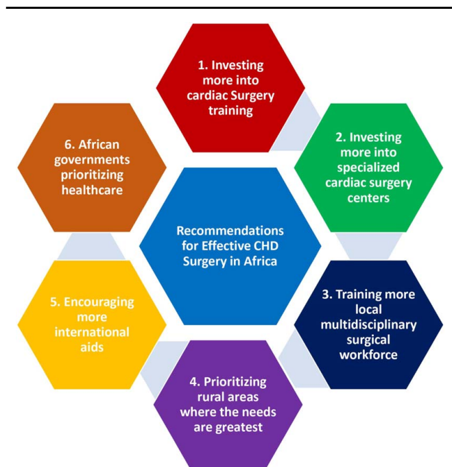
Figure 3. Recommendations and Strategies to Improve Congenital Heart Disease Care in Africa.

Telemedicine is another effective tool to ameliorate access to cardiac surgery services. Remote consultations between cardiac surgeons and healthcare providers in more rural areas may aid in reducing the need for patients to travel long distances to access care (Fig. 3). By implementing these strategies, the accessibility of