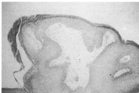
Fig. 3 Lacrimal canalicular papilloma. (Haematoxylin and eosin, \times 85 .)

base treated with cryotherapy. Eight months after this there was a recurrence in the superior canaliculus and a papilloma in the nose arising from the mucosa at the site of the previous dacryocystorhinostomy. Both were excised and treated with cryotherapy. He was last examined 10 years after this, and there were no further recurrences or further tumours. The histopathology on all specimens was similar to the first case.