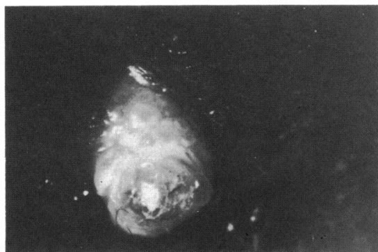
Fig. 2 Lacrimal canalicular papilloma: same case as Fig. 1 after elapse of two weeks.

There was then a respite of four years until he again developed symptoms at the age of 48, nine years after the original presentation. For three months he suffered mucous discharge from the previously treated right eye. A hard mass was palpable in the region of the lacrimal sac, and a dacryocystogram (Fig. 4) showed filling defects of the lacrimal sac compatible with multiple papillomata. He was treated with trifluorothymidine drops five times daily for two months with no relief. He then additionally developed recurrent papilloma of the tarsal conjunctiva. A dacryocystorhinostomy was performed and the lacrimal sac was found to be full of papillomata. All were excised along with the conjunctival papilloma and cryotherapy applied to their bases. Three months later, a small mass was noted in the inferior end of the incision scar. This was excised and found to be an intramuscular papilloma not communicating with the mucosa. Three months later there was a recurrence on the tarsal conjunctiva, which was excised and the