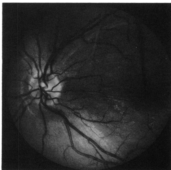
Fig. 1 Red-free photograph of grade I ERM in the left eye of a 23-year-old male with SC disease. Note the altered light reflex, roughened appearance, but absence of retinal distortion.

mydriasis. Red-free and colour photographs were taken, and fluorescein angiography was performed where appropriate. The grading of ERMs proposed by Joondeph 5 was adopted and is illustrated in Figs. 1-4. Additional data recorded included the extent of PSR lesions (clock hours of retina involved), the type of therapy, the visual acuity and grade of ERM when first diagnosed and when last seen, the age and genotype of patients, and the duration of observation.