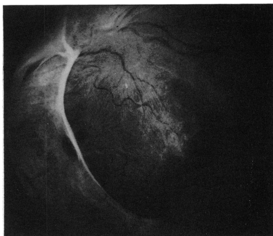
Fig. 4 Red-free photograph of grade IV ERM in the left eye of a 20-year-old female with SC disease. There is a tractional detachment at the superotemporal arcade with a macular hole.

ing localised ERM had been documented. Eyes with macular wrinkling associated with vitreoretinal traction from elevated PSR lesions secondarily involving the posterior pole were excluded. Cataracts prevented assessments of the posterior pole in 11 eyes.