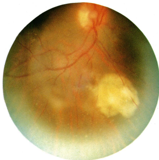
Fig. 1 Right fundus showing an inferior plaque of retinal exudation.

tion rate was 51 mm in the first hour, but chest x-ray and full blood count were normal; syphilis serology, autoantibodies, acute and convalescent serology (toxoplasma, cytomegalovirus, herpes simplex, and Epstein-Barr) were negative. On this basis idiopathic posterior uveitis was diagnosed. Treatment with 60 mg prednisolone daily was begun. Vision improved over five days to 6/9 OD, with resolution of macular oedema.