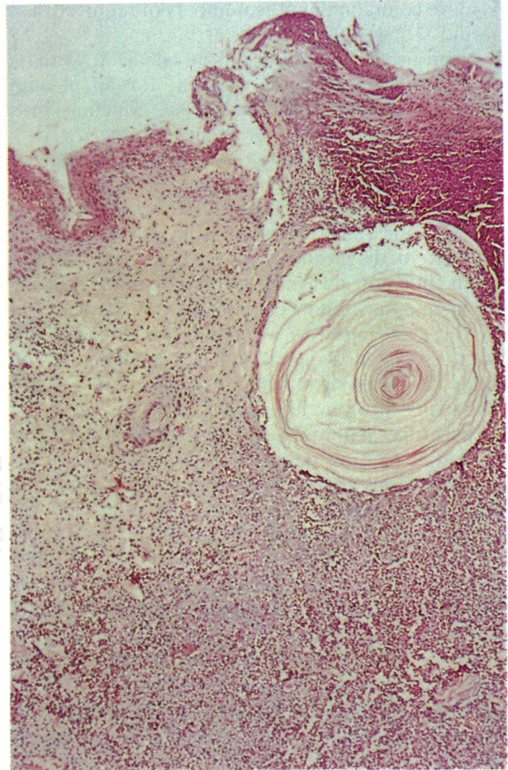
Fig. 3 Histological section through the excised upper lid tissue, showing the ulcerated skin and acute inflammation extending through the dermis. Haematoxylin and eosin.

The debrided lid and scalp tissue was sent for