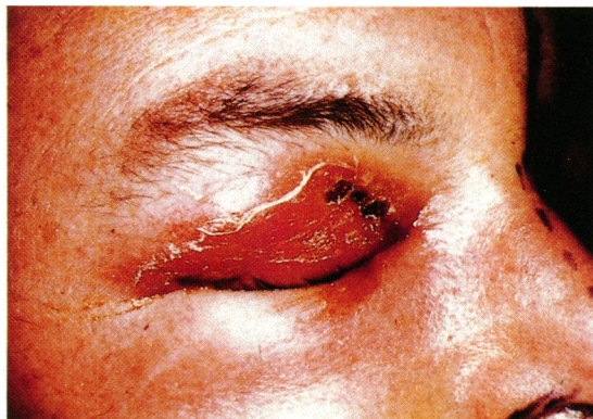
Fig. 1 Close up view of the upper lid, showing its violet hue and black areas of focal necrosis.

Twenty-one hours after his admission he suffered a