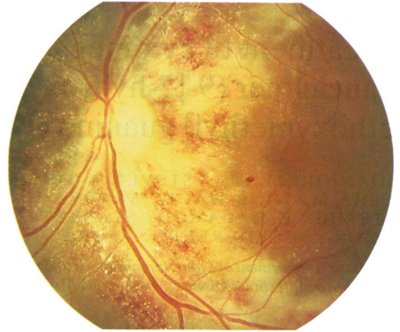
Fig. 2 After 21 days of therapy both the optic nerve and arcades are clearly visible. The acuity was stable at 20/30.

While in the hospital the patients had daily eye