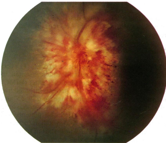
Fig. 1 Case 3. There is extensive involvement of the optic nerve head with obscuration of the disc. The visual acuity in this patient was 20/50.

All patients received ganciclovir 2.5 mg/kg intravenously every eight hours for a 21-day course. Two patients received more than one course in hospital. Two of the patients received subsequent maintenance therapy after finishing the 21-day course. It consisted of 5 mg/kg intravenously once per day for