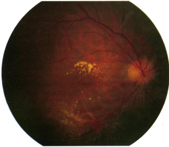
Fig. 4 After 10 days of therapy there is still some mild residual oedema of macula, and some borders of the optic nerve are now clearly visible. The acuity was 20/200.

five of seven days every week administered through a Broviac catheter placed into a subclavian vessel.