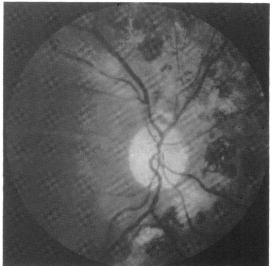
Fig. 4 Total regression of new vessels at the right optic disc following panretinal photocoagulation. Horizontal traction fold of the internal limiting membrane across the right macula. Markedly pigmented scars due to previous laser treatment.

peripheral retinoschisis may result in 'vitreous veils', which may contain veins and arterioles which are continuous with the retinal vasculature, 14 and some reports contain diagrams showing such vascularised veils attached to the optic disc. 8-10 Vitreous haemorrhage has been described, but unlike the condition in