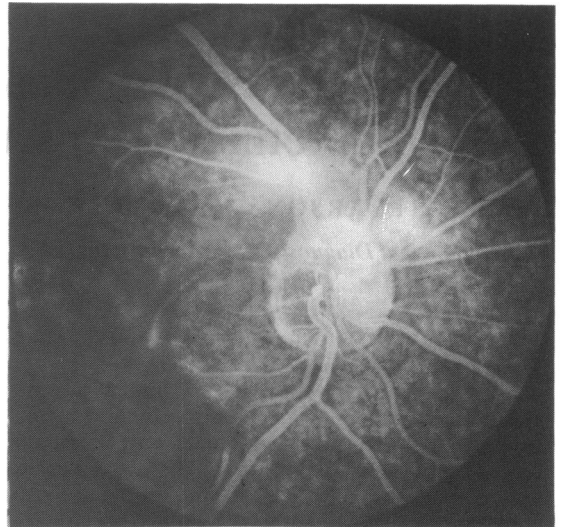
Fig. 3 Fluorescein angiogram showing leakage of dye from new vessels at the right optic disc.

peripheral retinoschisis may result in 'vitreous veils', which may contain veins and arterioles which are continuous with the retinal vasculature, 14 and some reports contain diagrams showing such vascularised veils attached to the optic disc. 8-10 Vitreous haemorrhage has been described, but unlike the condition in