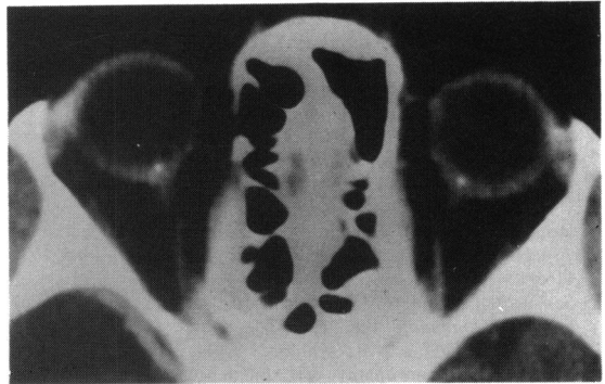
Fig. 3 Orbital CT scan in March 1986 showing bilateral optic nerve head calcification.

hypertensive children with disc swelling. Drusen, through mass effect, may have raised the intraneural tissue pressure, 12 leading to greater susceptibility to ischaemia. The crowded discs reported with drusen, 15,18 as in our patient and others, 9 may have been another factor. Increased circulating vasoconstricting agents may exacerbate hypoperfusion in the setting of hypotension in posthaemorrhagic AION 19 and in AION following cardiopulmonary bypass. 20,21 Peritoneal dialysis may have contributed to her AION, as suggested by the association with haemodialysis 16,22 together with hypotension 22 and intraocular pressure elevation 23,24 in that setting. Oral contraceptives, reported to be associated with various forms of vaso-occlusive disease (including possibly AION 25 ) even months after their cessation, seem unlikely to be of significance in our patient, though not entirely excluded.