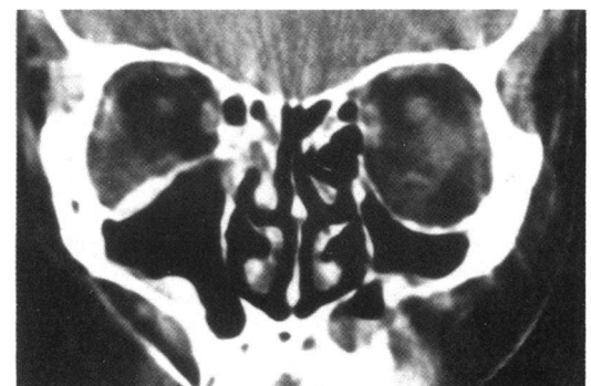
Figure 3: Case 2. CT scan demonstrating imploded left maxillary sinus.